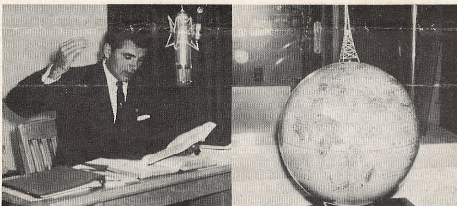
Mr. Garner Ted Armstrong thunders God's message . . . around the world!